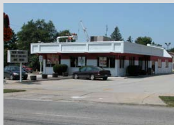
after (left) before (right)

their vicinity and their price range, keeps coming back for more. The success of this project started a renaissance along Main Street and led the town to commission new guidelines for future development in the area.