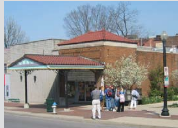
after (left) before (right)

desire to maintain the character of the streetscape. Tartan bought the property, met with school administrators and presented the Bloomington Historic Commission with a plan that satisfied all constituents, with ground-level retail beneath two floors of university offices. The project is one of only six statewide anticipating LEED certification.