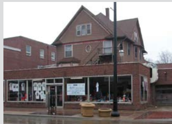
after (left) before (right)

dining. A year after opening, Potbelly still had a line of customers out the door. The enthusiastic response drew Chipotle and Noodles & Co. to a development down the street, adding more dining options, and more life, to the area retail scene.